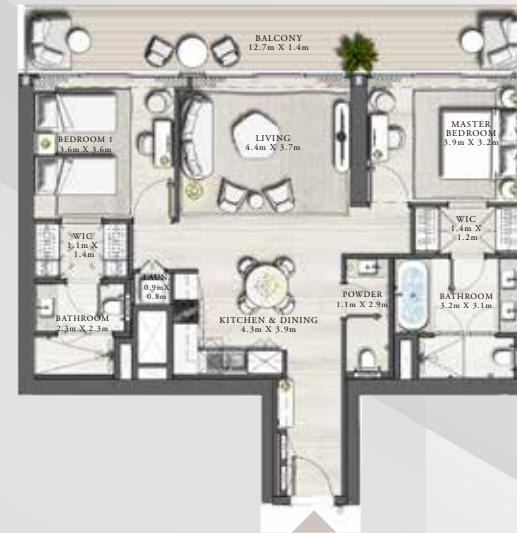
KEY PLAN LEVEL