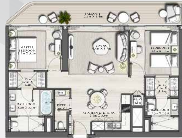
KEY PLAN LEVEL