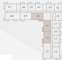
LEVEL 2 TO 14