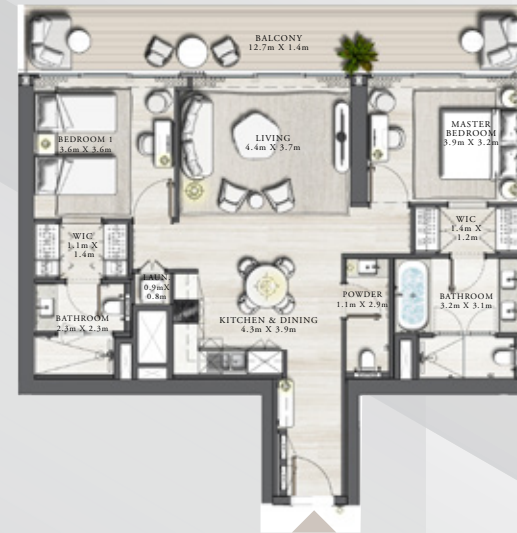
KEY PLAN LEVEL