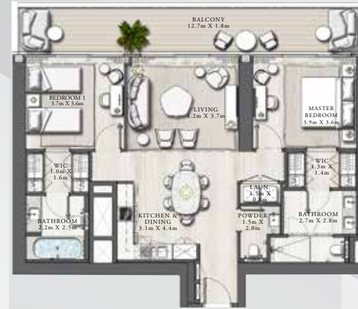
KEY PLAN LEVEL