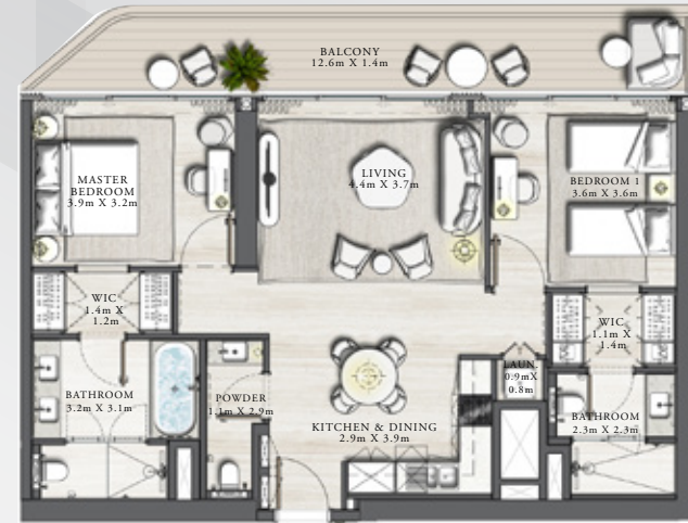
KEY PLAN LEVEL